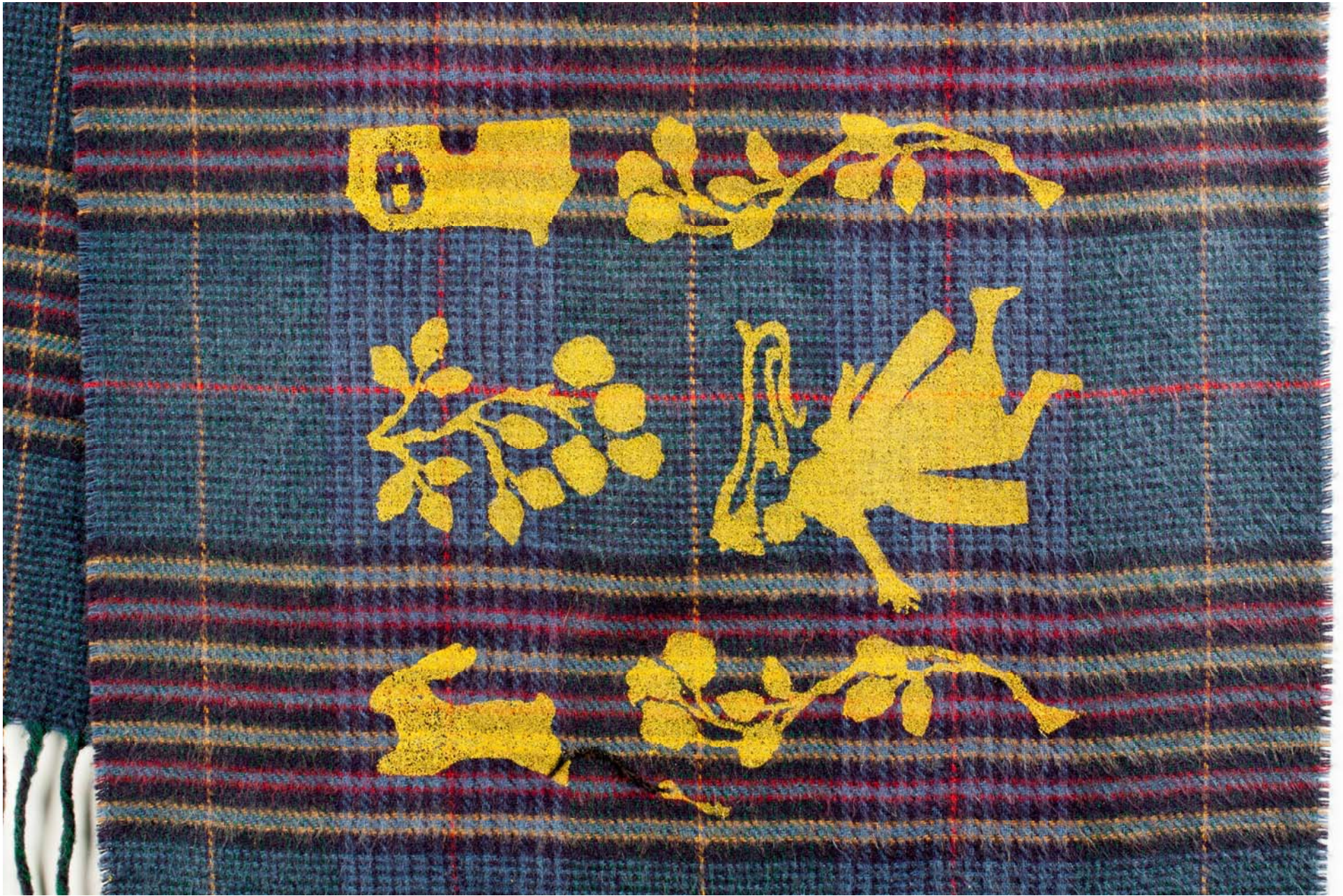
Figure 10: Jenny's Bunny (Detail).