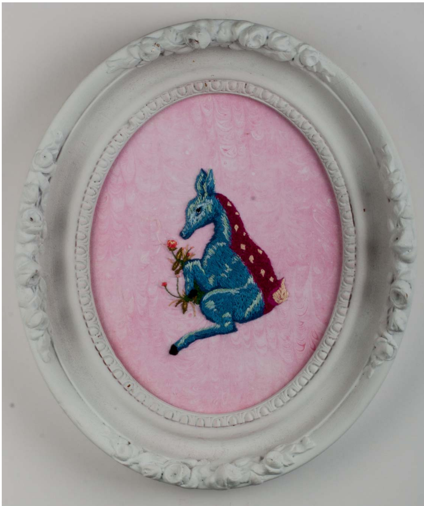
Figure 12: Kangadeer.