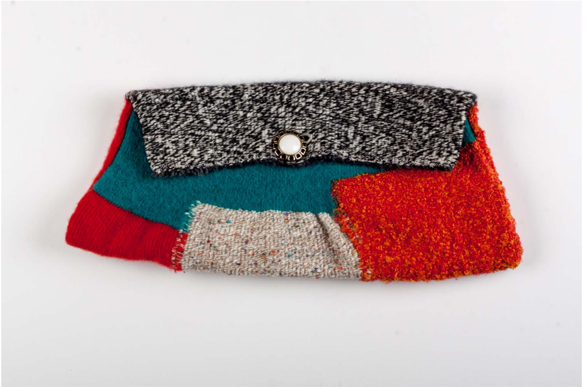
Figure 4: Clutch.