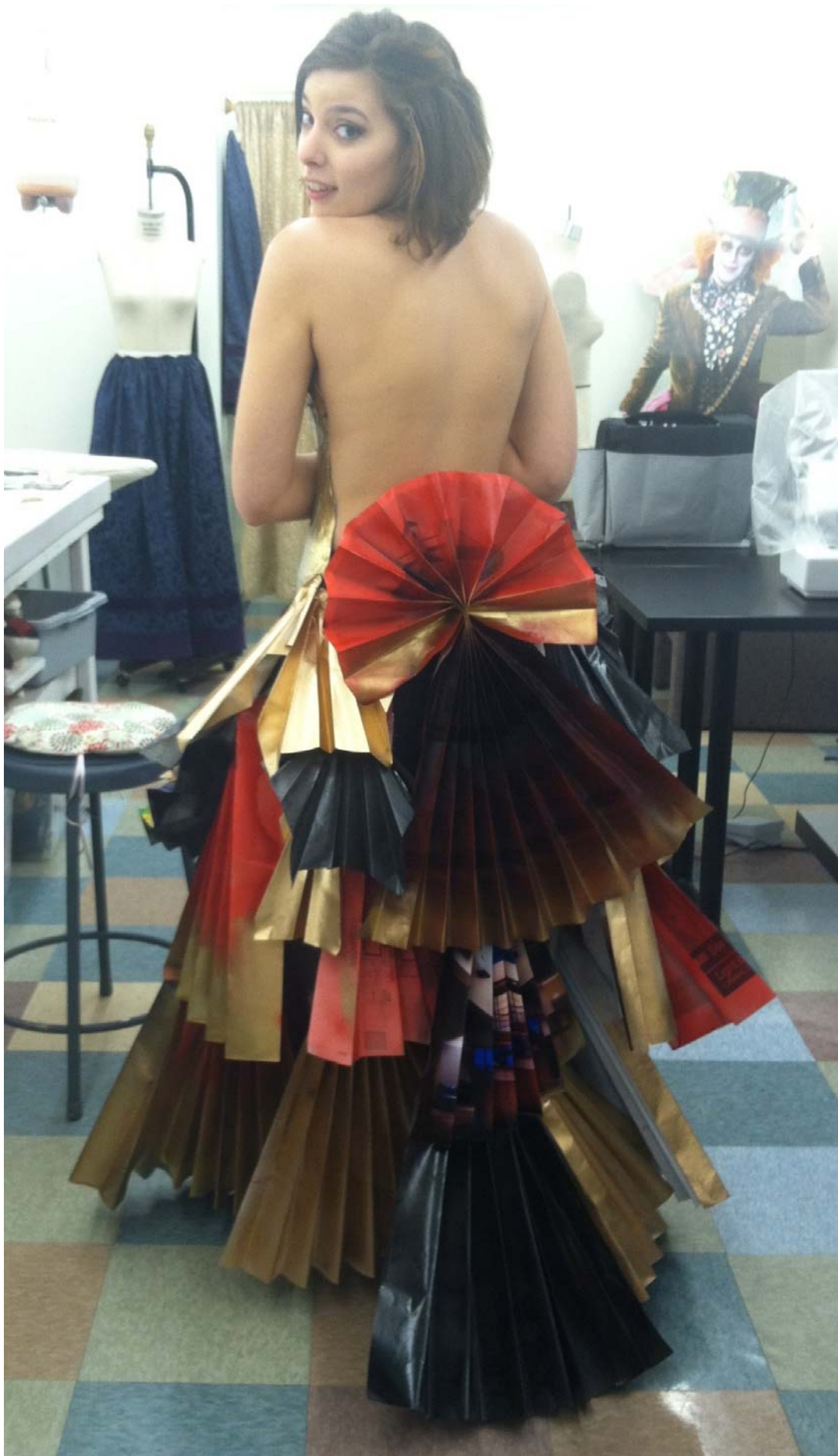
Figure 14: Queen Of Hearts (Detail).