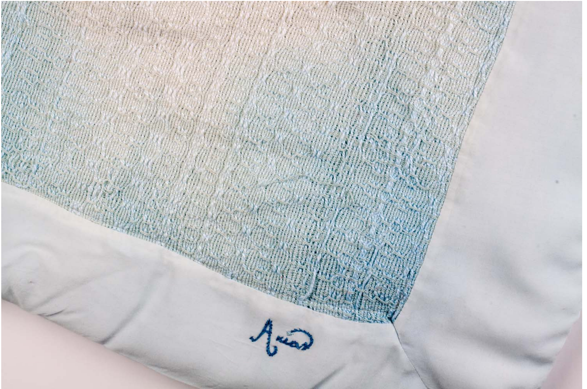
Figure 2: Baby Blanket (Detail).