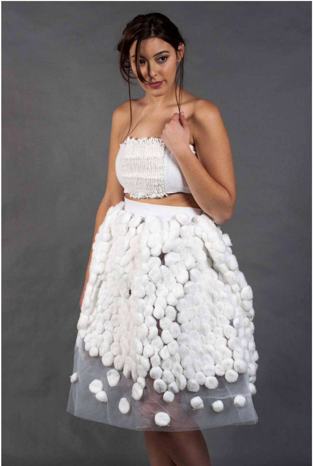
Figure 19: Time To Clean.