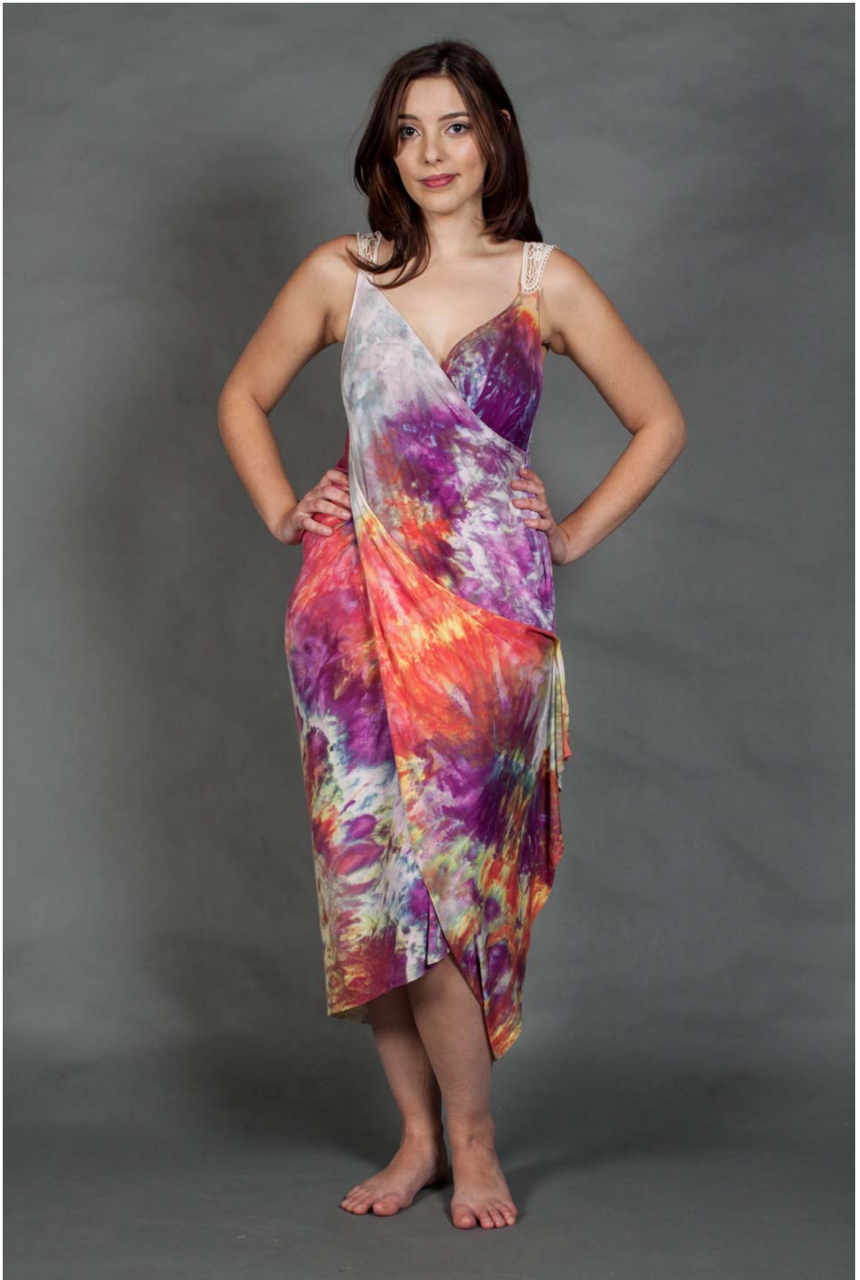
Figure 6: Dress At Delphi.