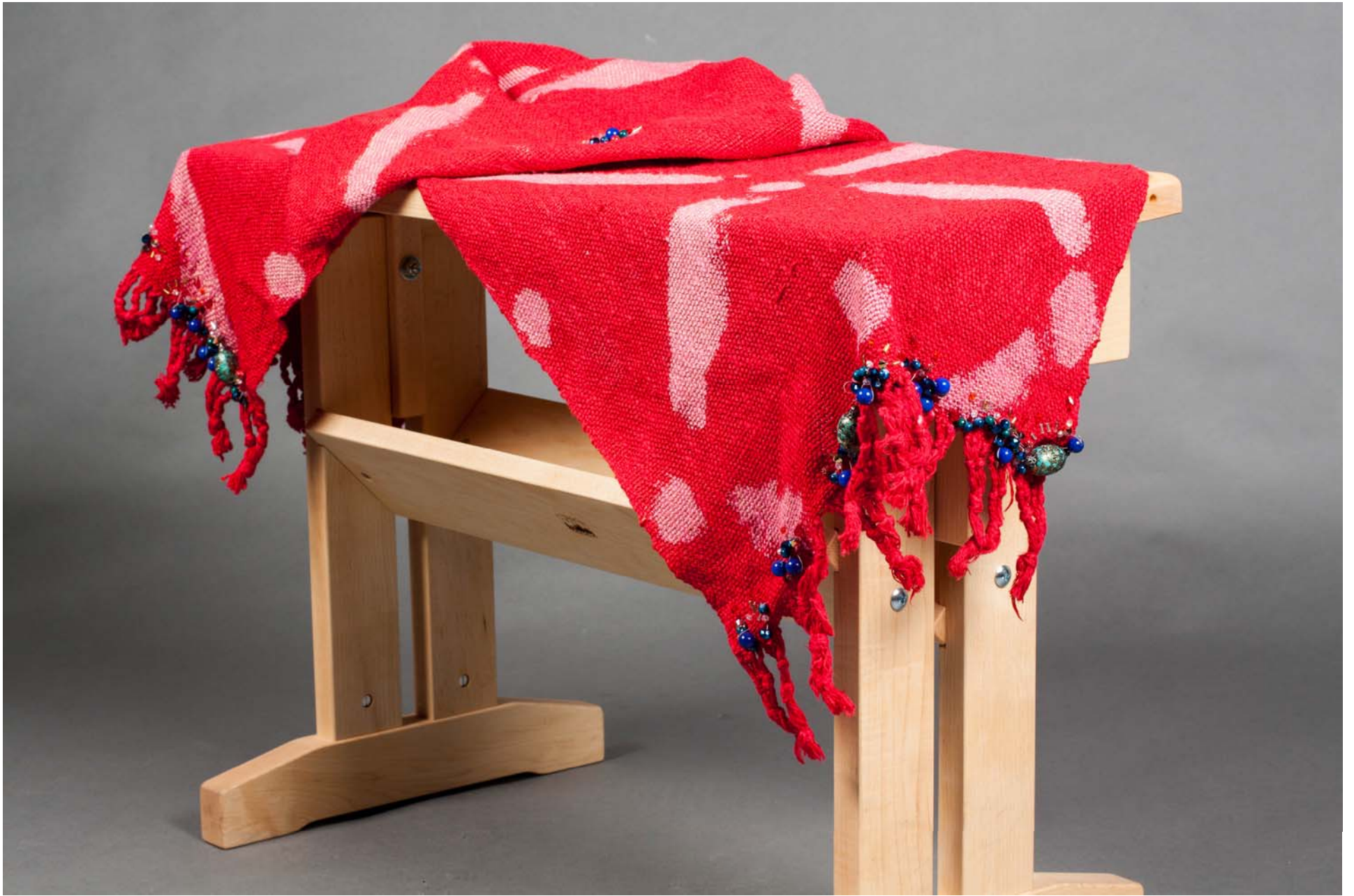
Figure 21: Treasure Carpet.