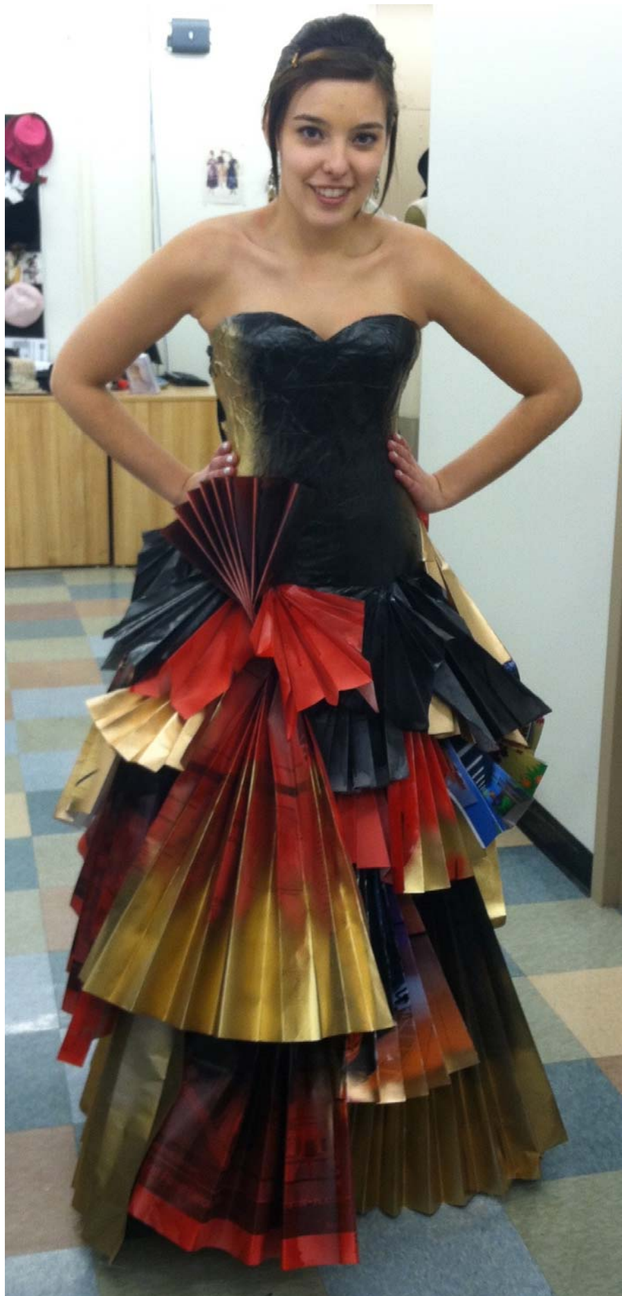
Figure 15: Queen Of Hearts.