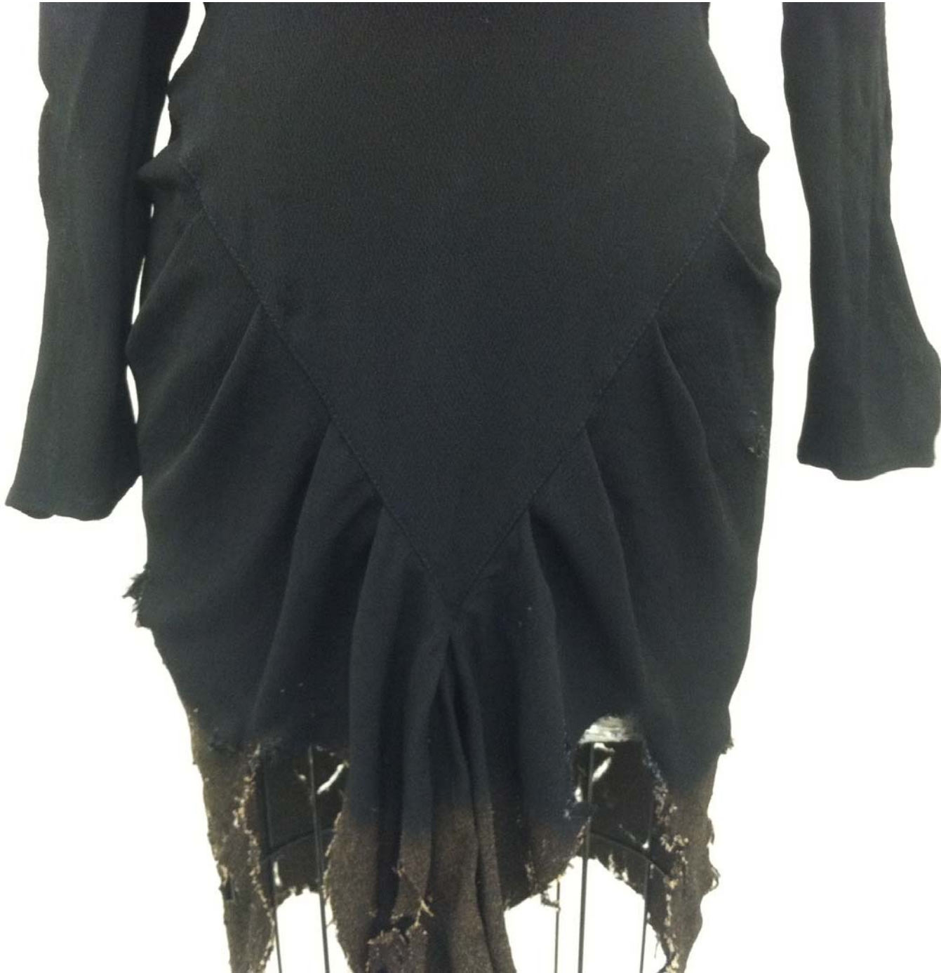
Figure 8: Helena (Detail 2).