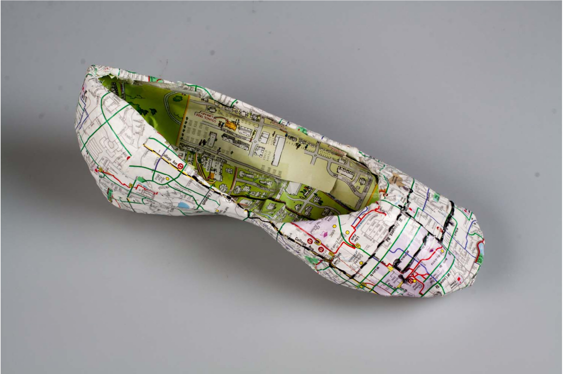
Figure 1: A Day In A Shoe.