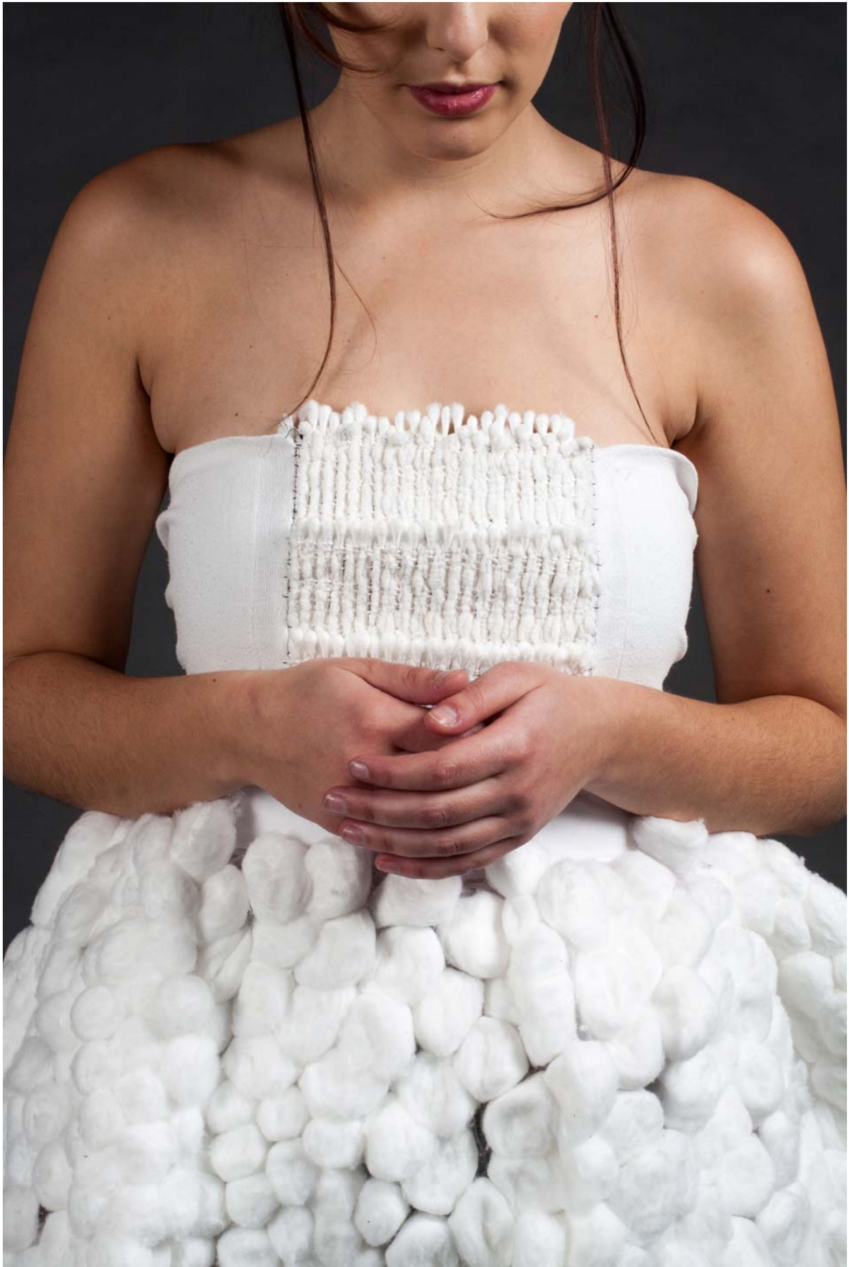
Figure 18: Time To Clean (Detail).