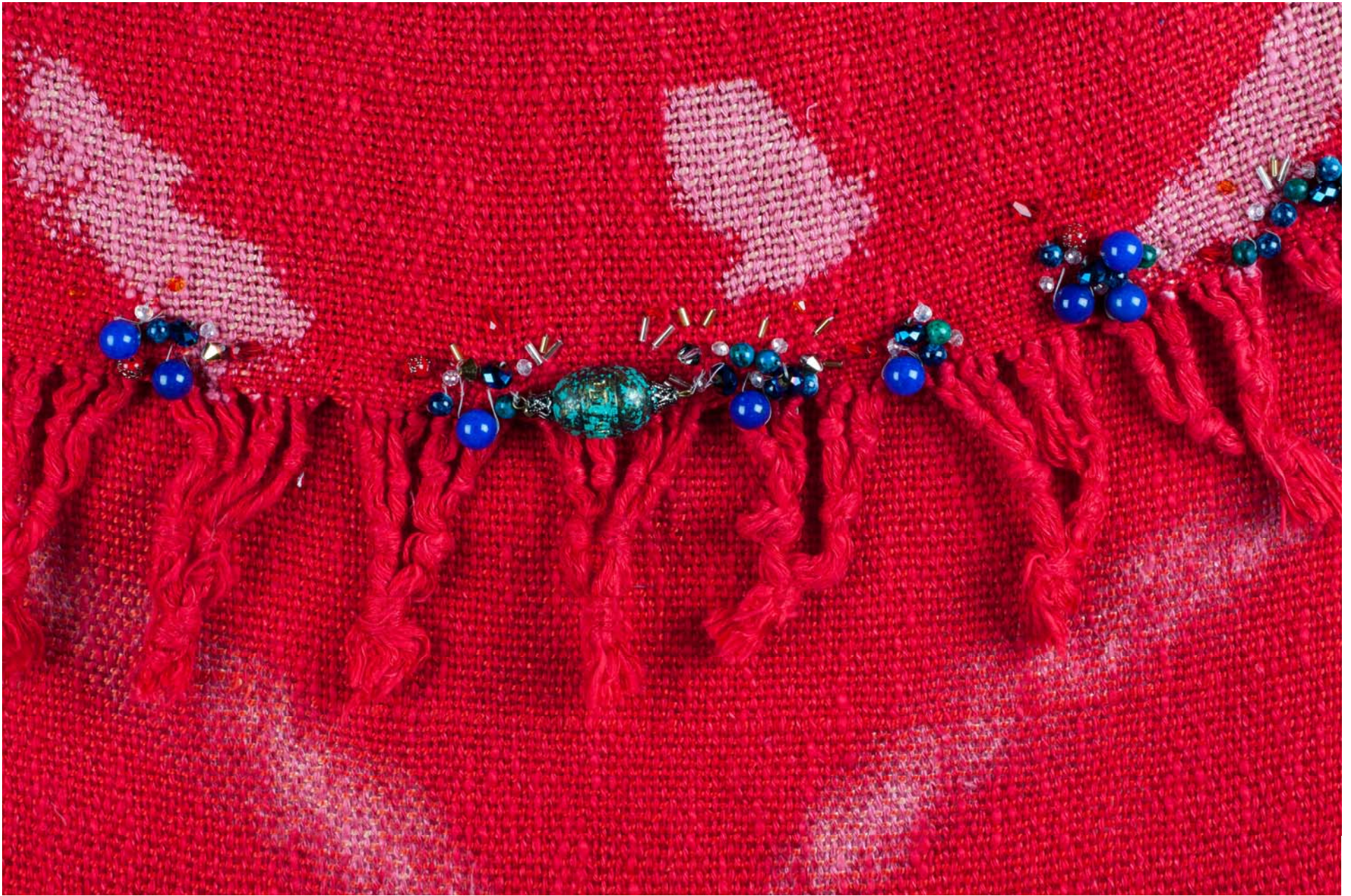
Figure 20: Treasure Carpet (Detail).