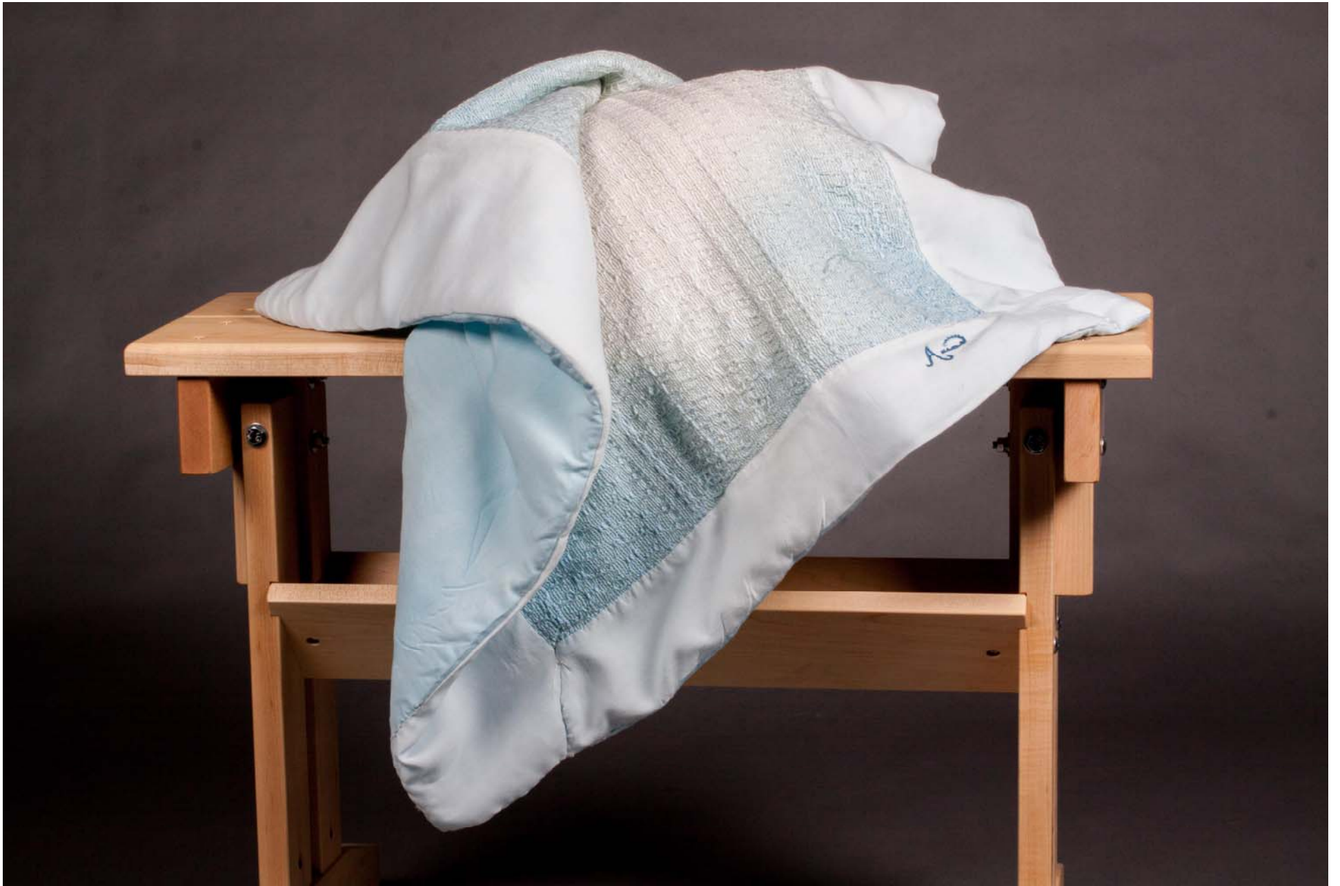
Figure 3: Baby Blanket.