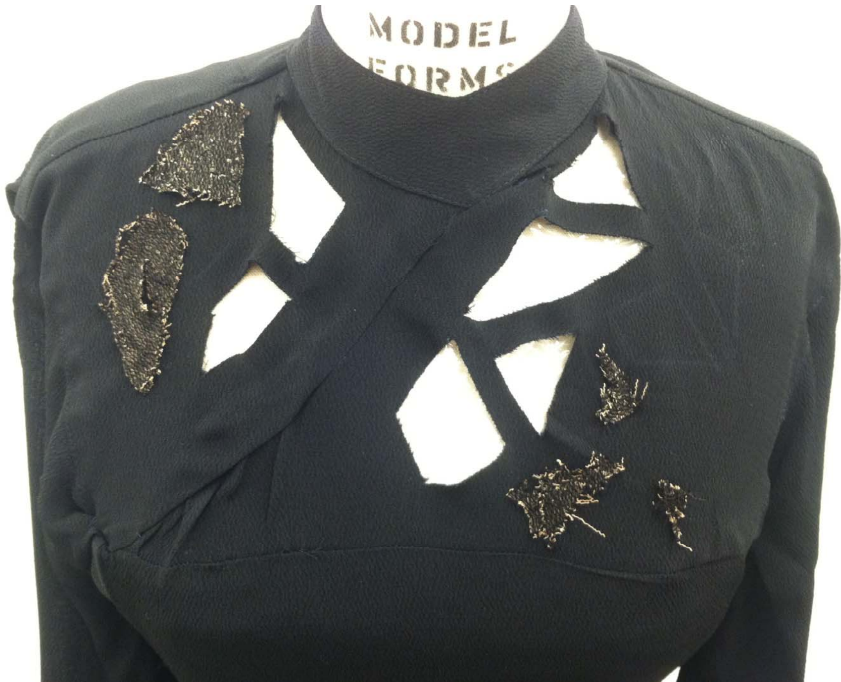
Figure 7: Helena (Detail 1).