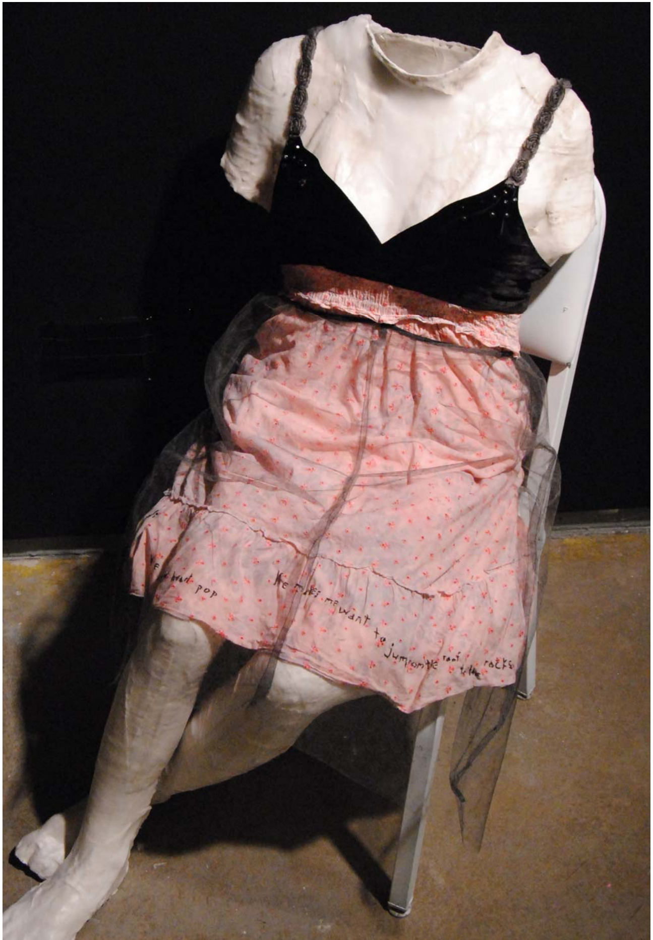
Figure 16: Strawberry Dreams.