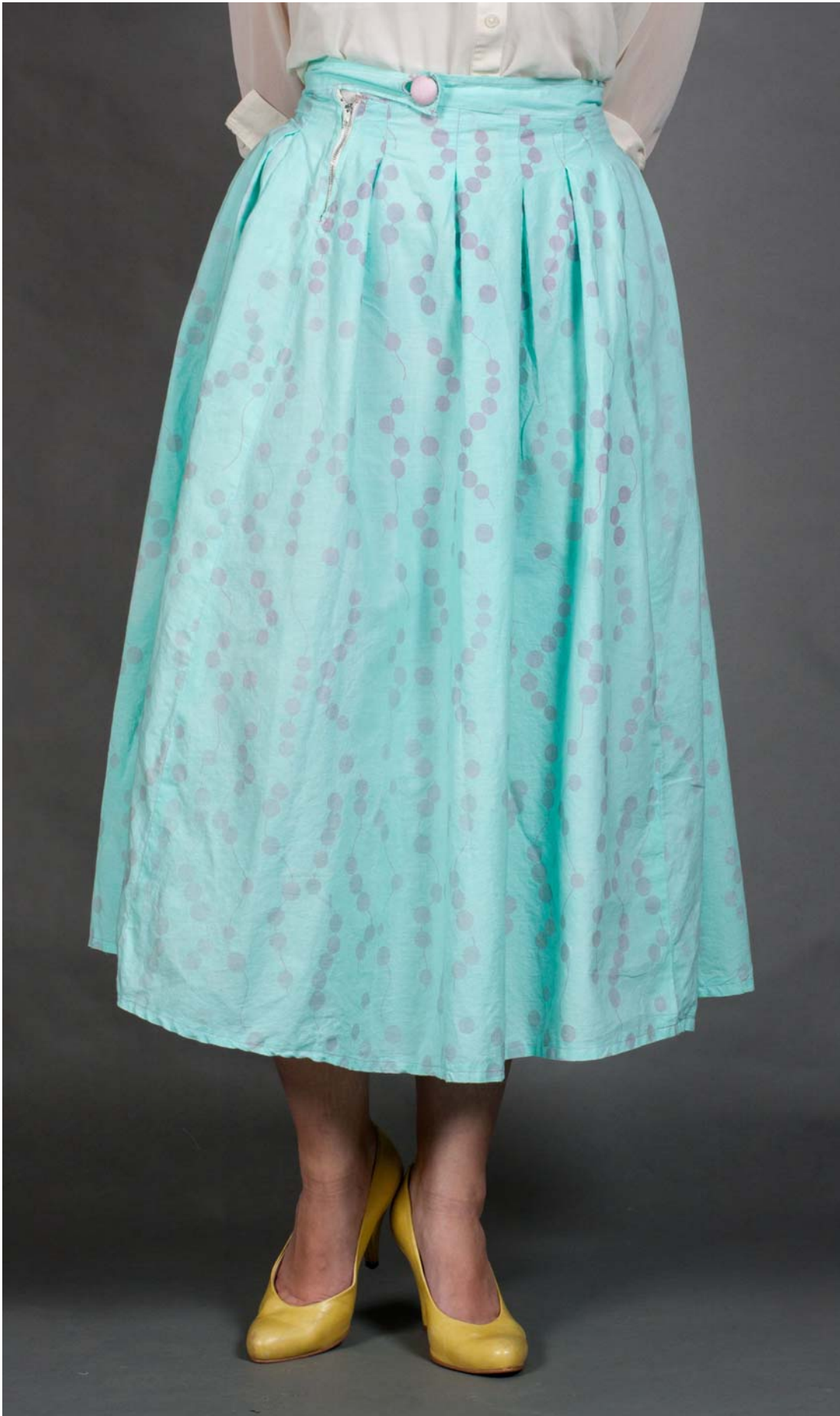
Figure 13: Lydia's Skirt.