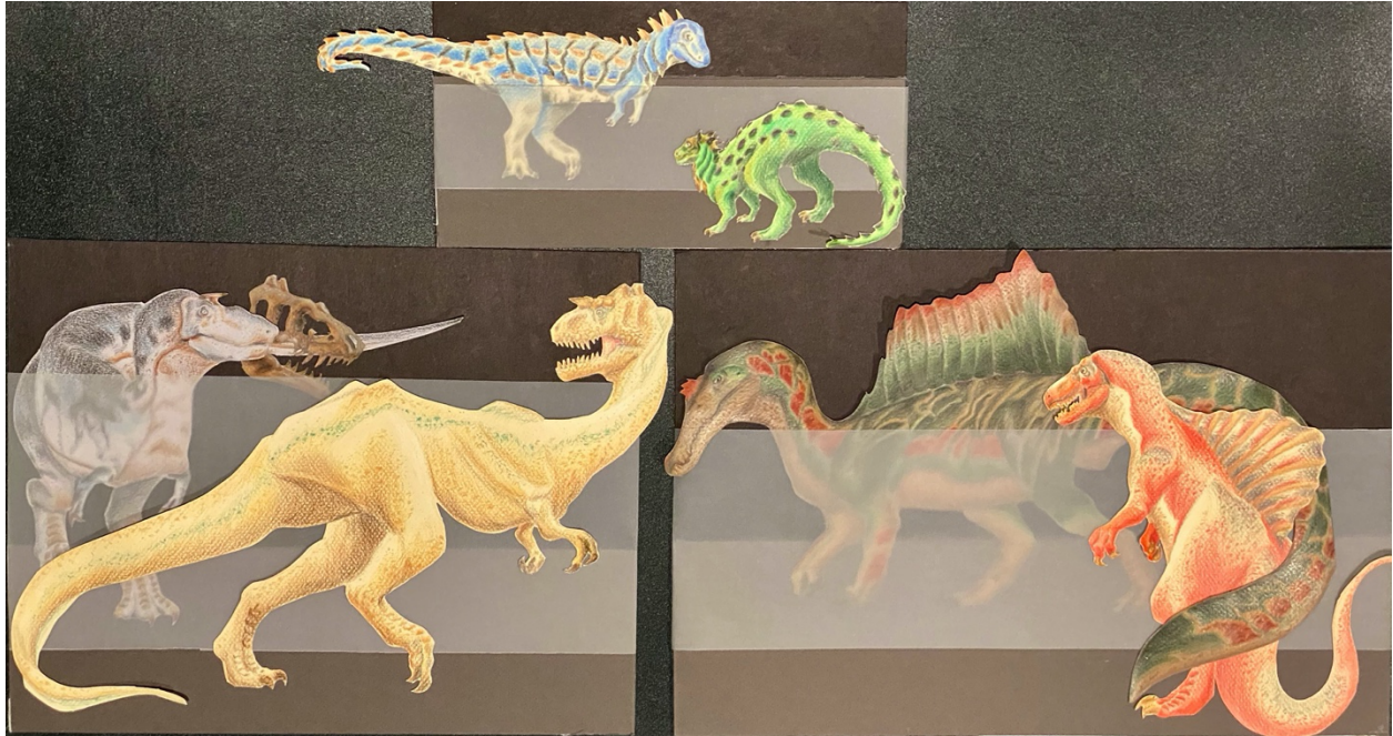
Figure 4: Retrospective Accuracy