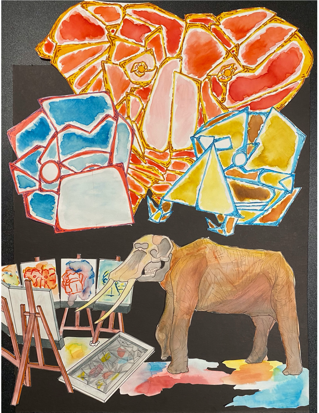
Figure 2: Artist's Memory