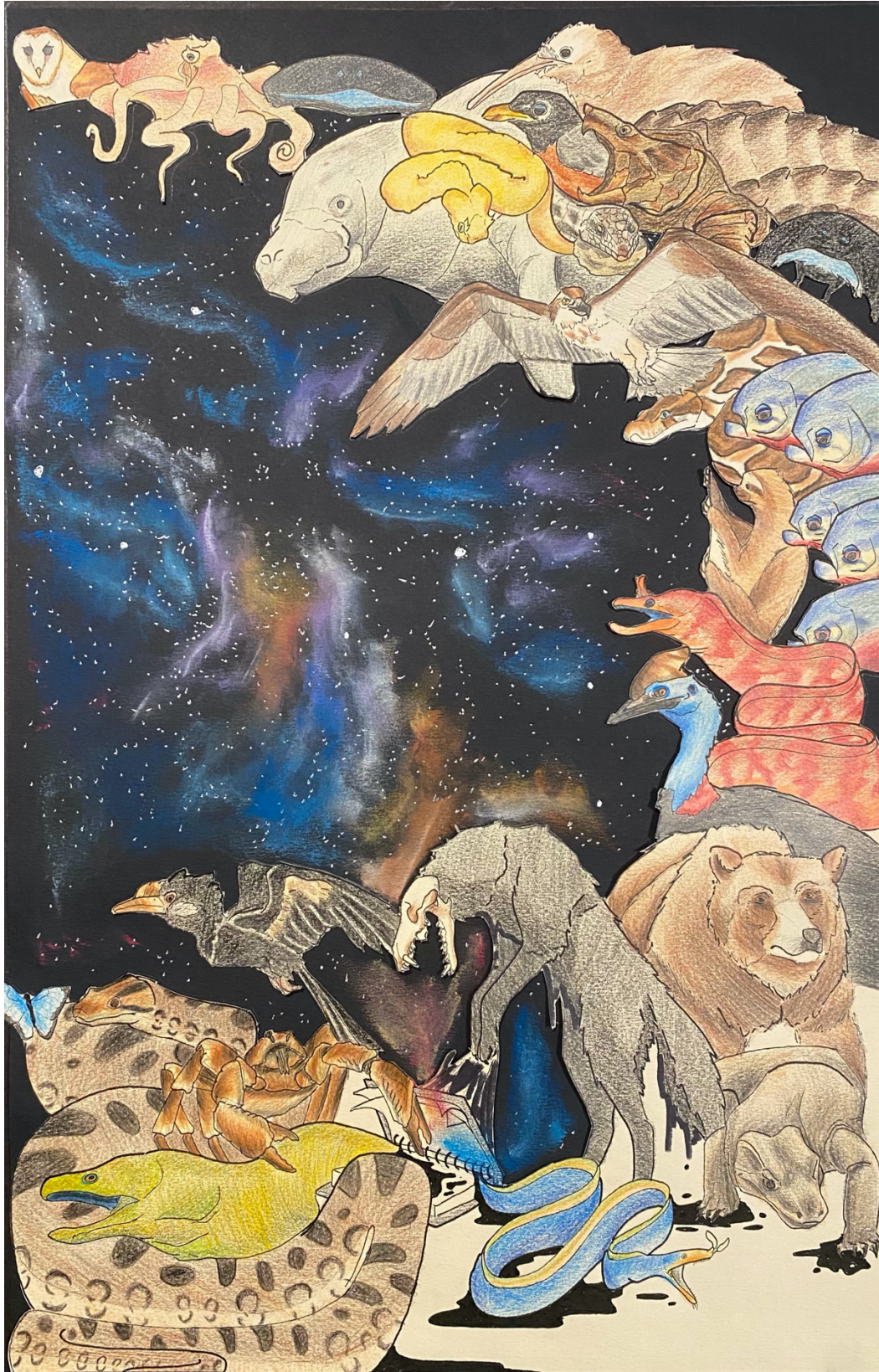
Figure 1: Needing New Subjects