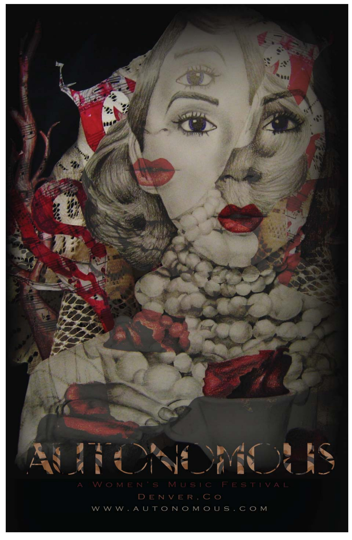
Figure 1: Autonomous Music Festival.