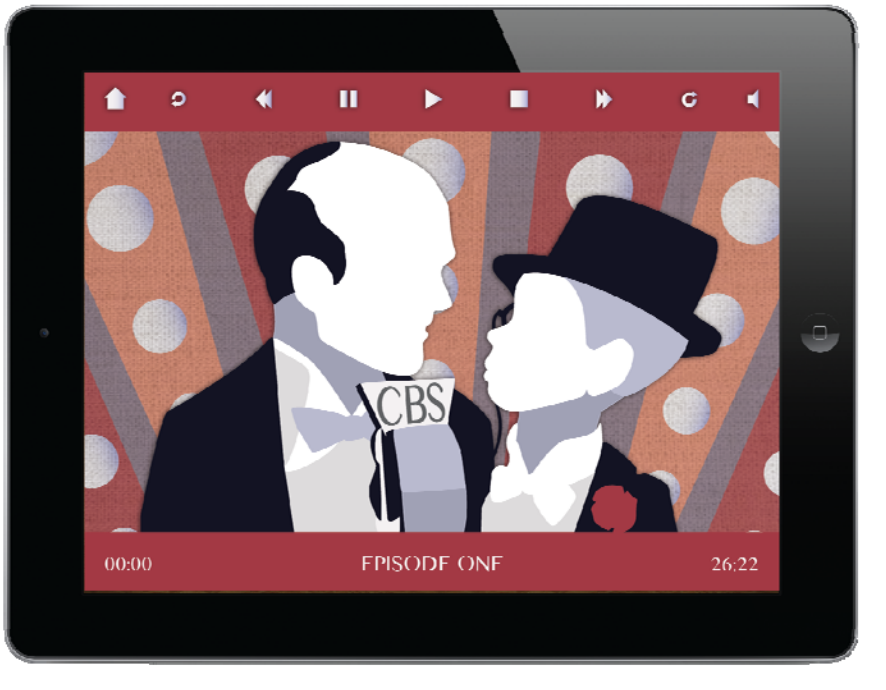
Figure 2: Old Time Radio App.