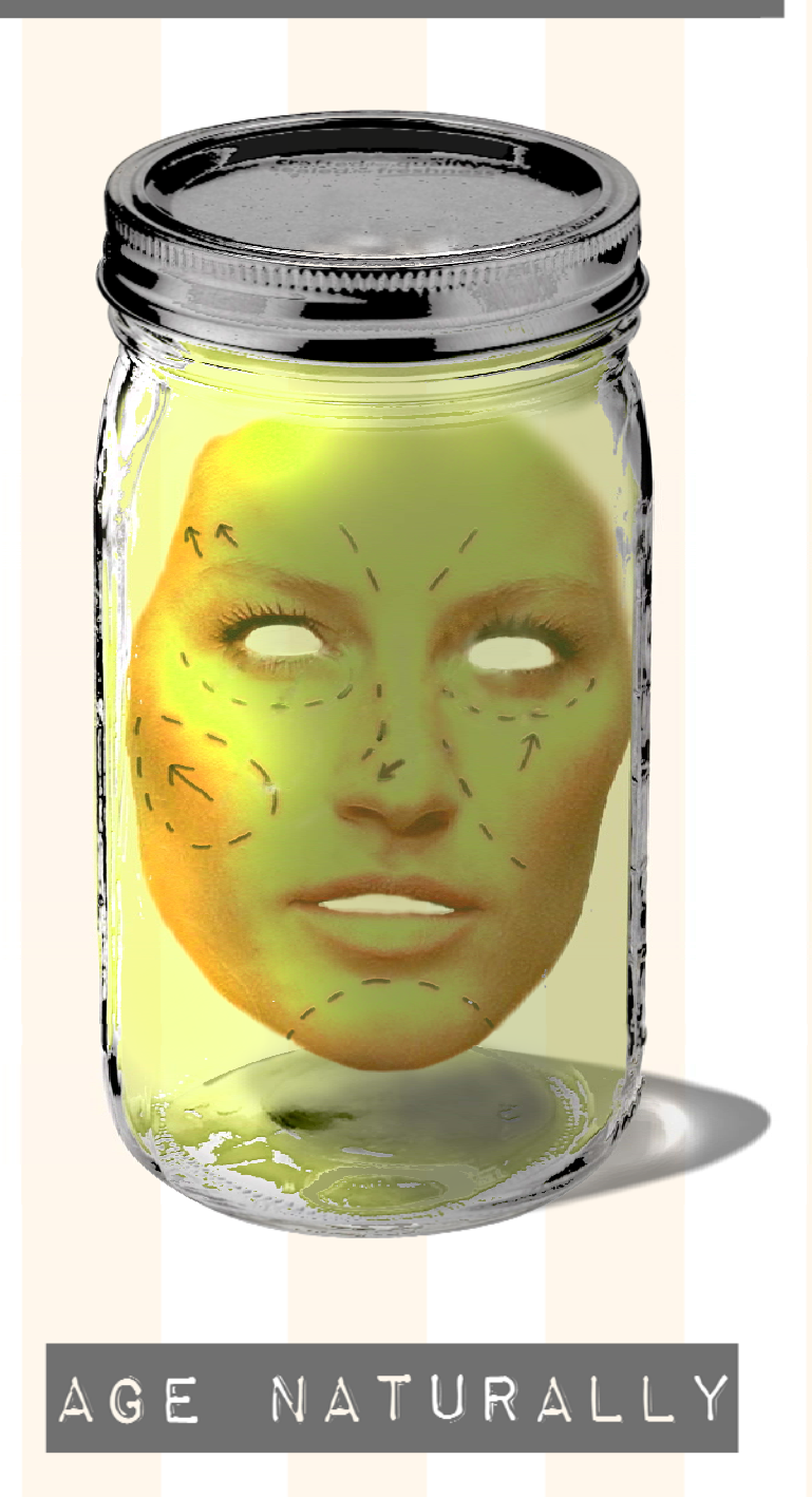
Figure 7: Age Naturally.