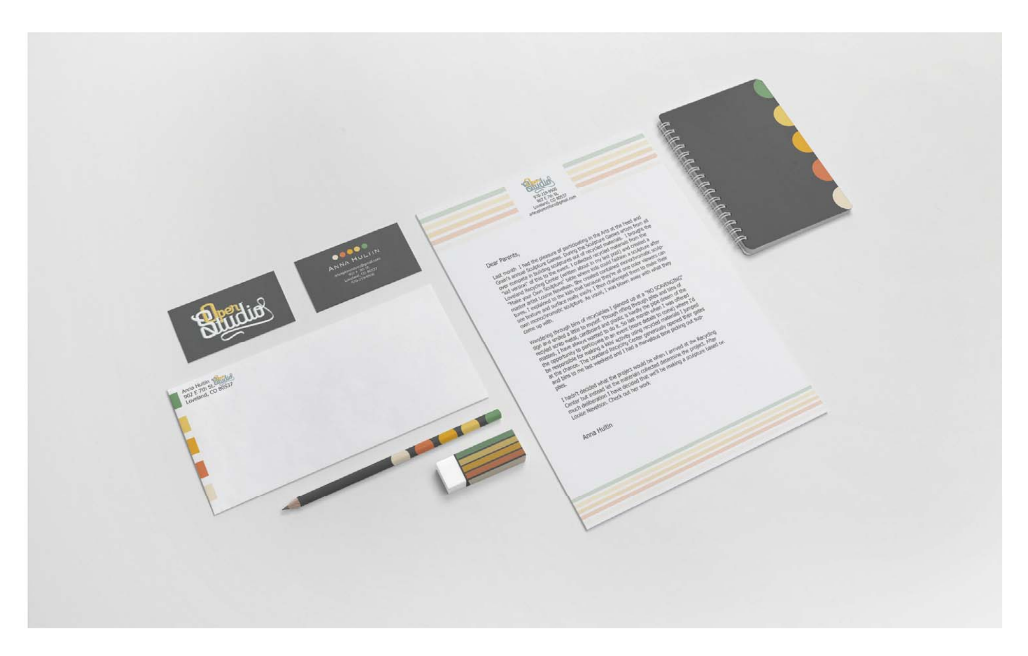
Figure 4: Open Studio Brand Identity.