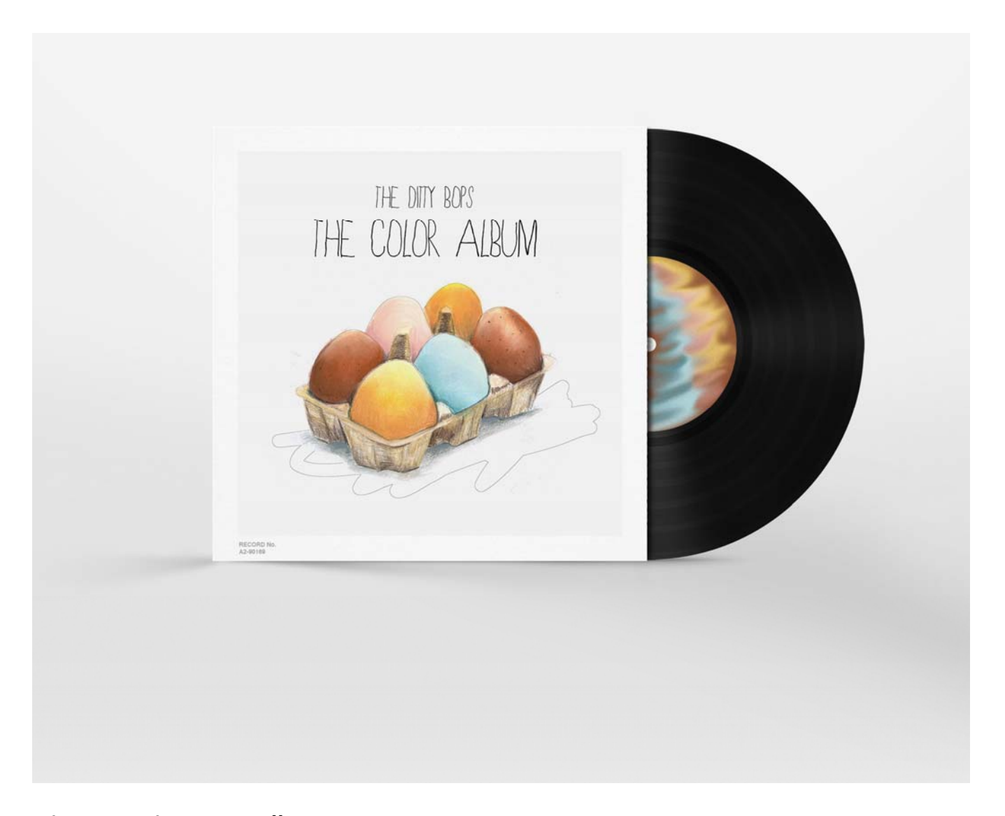
Figure 3: Ditty Bops Album Cover.