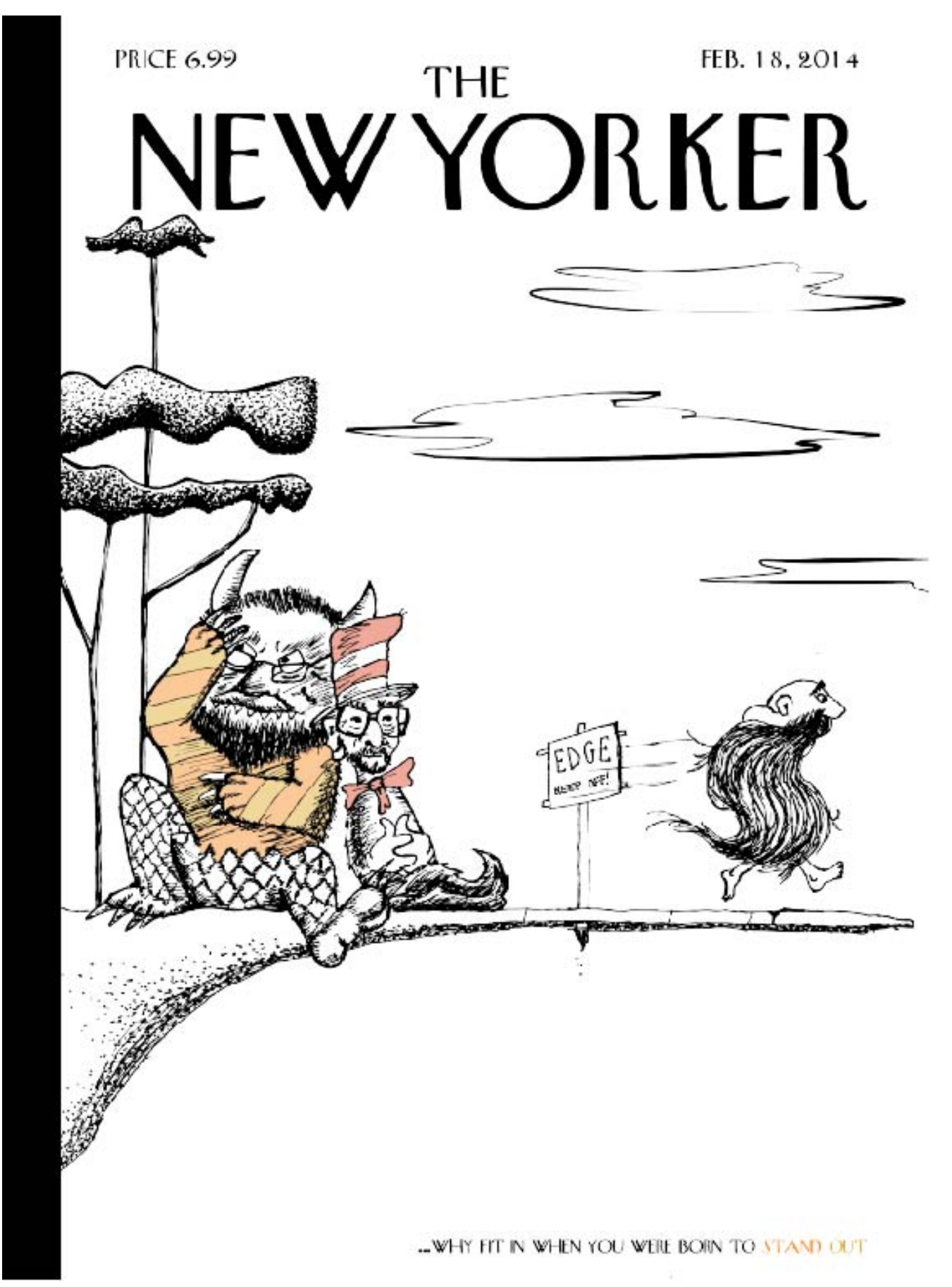
Figure 8: The New Yorker Cover.