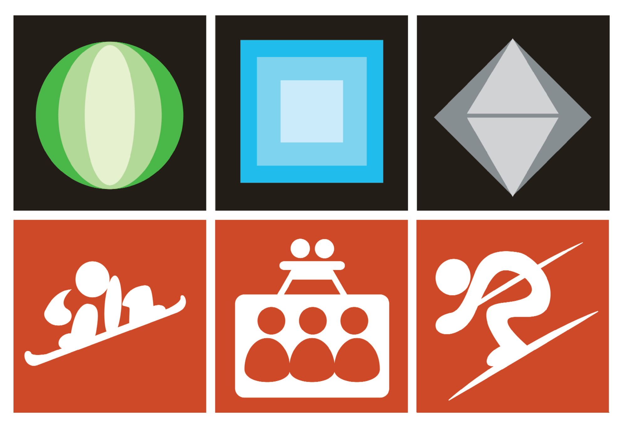
Figure 5: Ski Resort Icons.