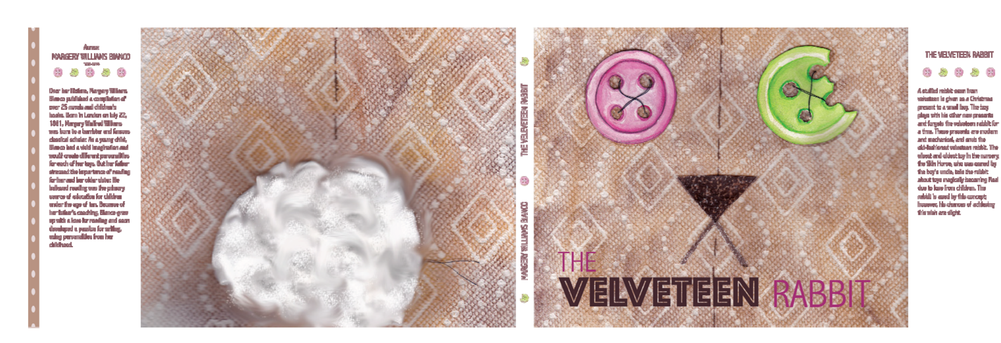
Figure 9: The Velveteen Rabbit Book Cover.