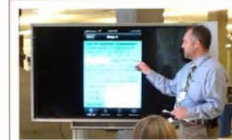
June: MedCalc and ABG Acid-Base Eval