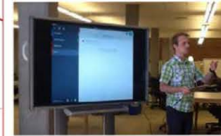
August: Explain Everything, Notability, and iAnnotate PDF

Eccles Library @EcclesLib ...@angeldemirev showing us 3 great apps at #UAppyHour!