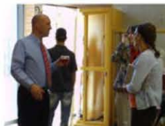
Networking with others September: In Case of Crisis- Education

Eccles Library @EcclesLib A full house at #UAppyHour!