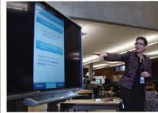
March: Prevent Group B Strep

Eccles Library @EcclesLib ...@angeldemirev showing us 3 great apps at #UAppyHour!