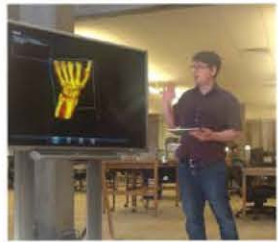
May: ImageVis3D Mobile