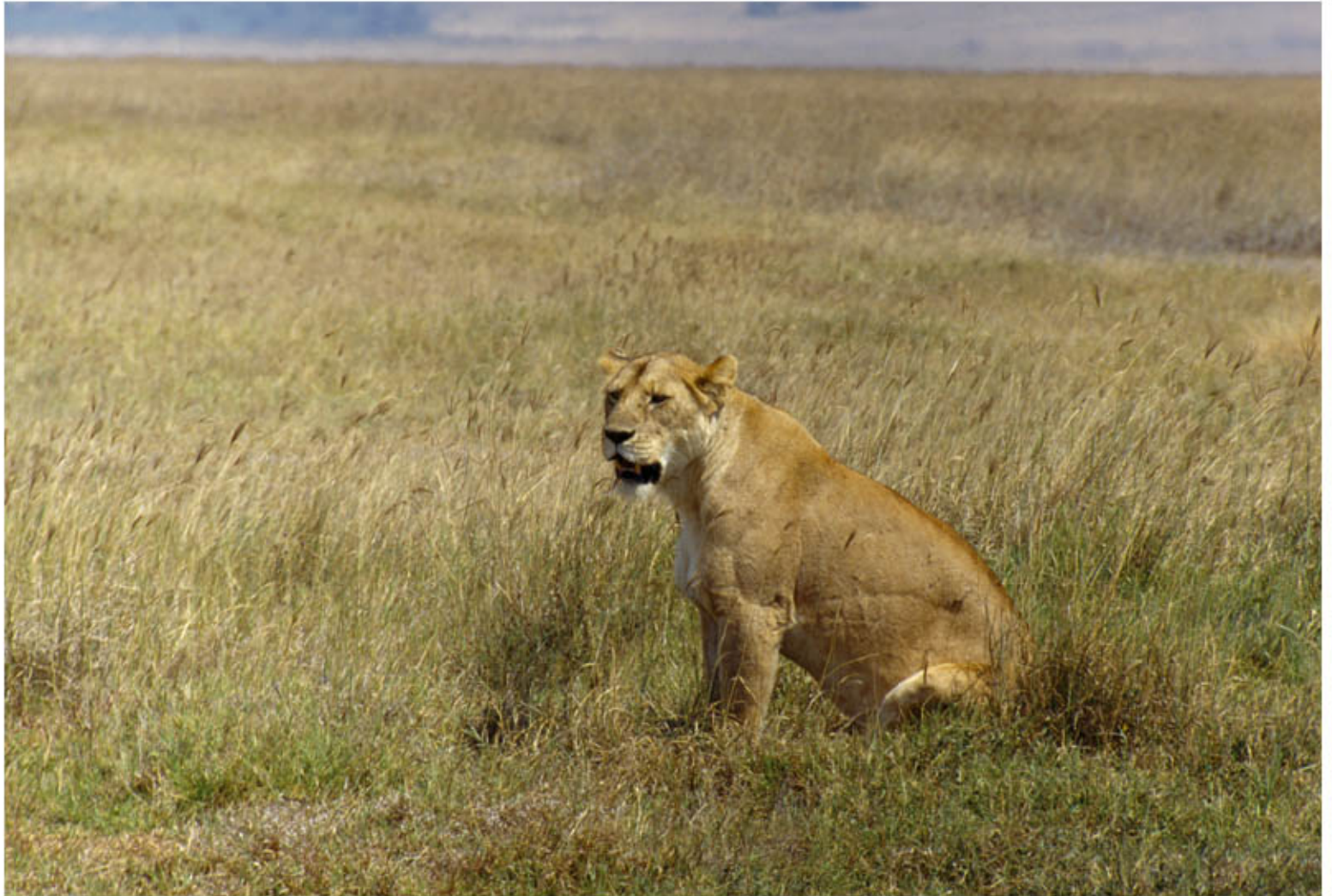
Lion kill of zebra July 3, 1995