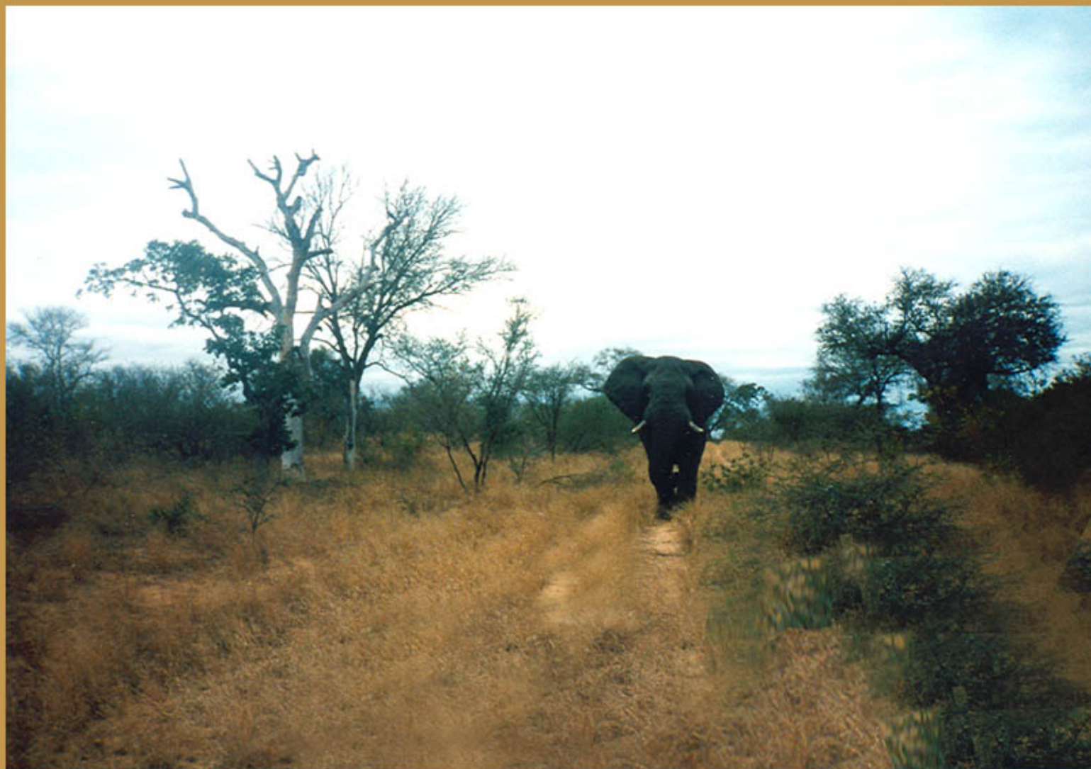
Elephant charge July 13, 1995