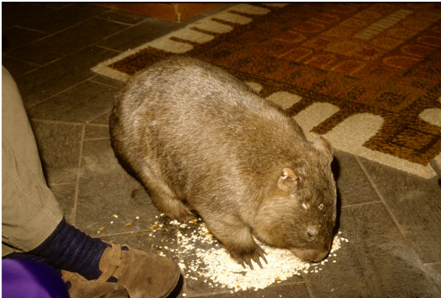
Wombat at Val Plumwood's